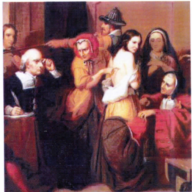
Figure 5 - In search of the satanic marks.