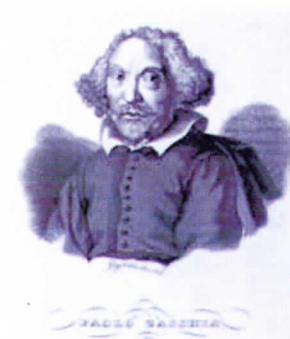
Figure 4 - Paolo Zacchias

been replaced by a gold epithesis 2 . His second reign was even more despotic than the first, and it too led to his eventual overthrow in 711, abandoned by his army who turned on him before decapitating him.