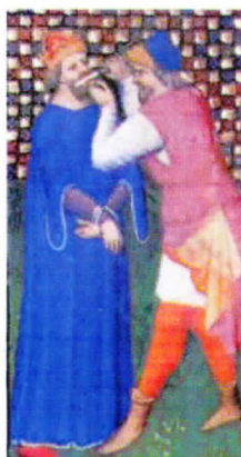
Figure 3 - Justinian's nose amputation

The Byzantine Emperor Justinian II (668-711AD), called the Rhinotmetos (ὁ Ρινότμητος, "the slit-nosed"), was an ambitious and passionate ruler who was keen to restore the Roman Empire to its former glories, but he responded poorly to any opposition to his will. Consequently, he generated enormous opposition to his reign, resulting in his deposition in 695 in a popular uprising. His nose was cut off to prevent him seeking the throne again; such mutilation was apparently common in Byzantine culture (Figure 3). Justinian returned to the throne in 705 with the help of a Bulgarian and Slav army. His nose had